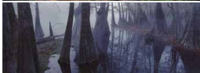
Karen Glaser’s works, from top:

“Fire in the Pines, Big Cypress #1,” Big Cypress National Preserve