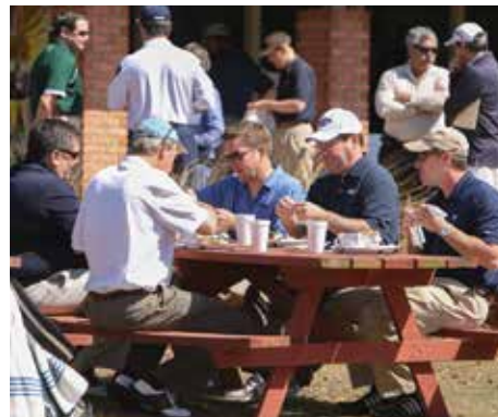
Players enjoy a delicious lunch before the tournament.