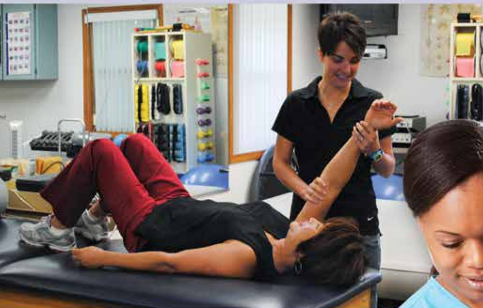
Graduates in Pensacola State's Physical Therapist Assistant program are finding jobs quickly and enjoying lucrative, satisfying careers.

Pensacola State PTA students go through multiple clinical placements to become as job-ready as possible.