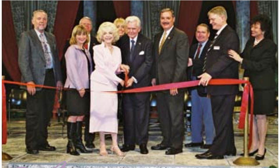
Jim Lehrer, Executive Editor and Anchor, The NewsHour with Jim Lehrer