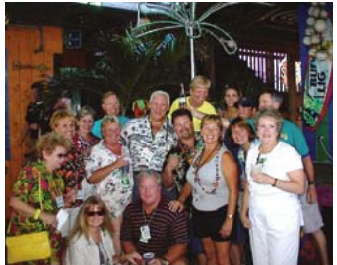
PJC's Zoo Animal Technology Program joined the long list of recipients who benefit from the good deeds of the Emerald Coast Parrot Head Club.