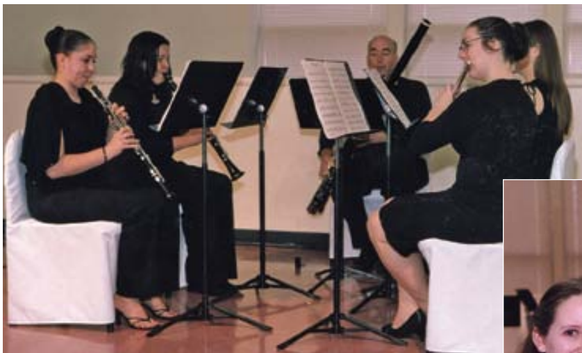
The PJC Woodwind Quartet provided a musical interlude for attending donors and scholarship recipients.