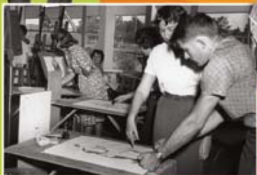
Alumni & Friends Celebration Saturday, October 22, 2005