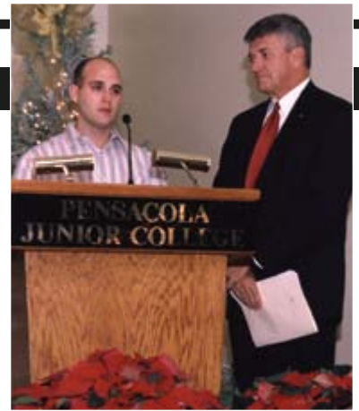
Students come shining through...