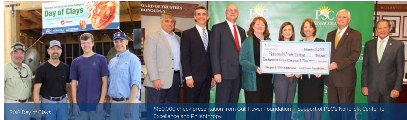
2018 Day of Clays