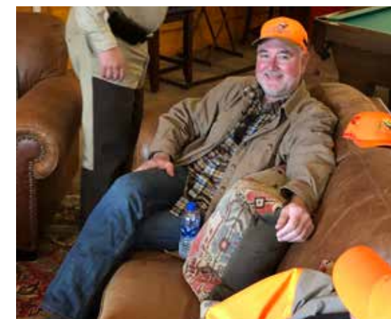
Relaxing at the 2018 Quail Hunt