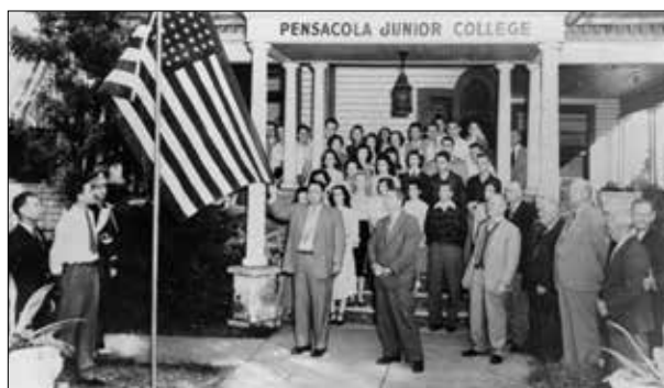
Flag raising ceremony at Pensacola Junior College’s original site, the Aiken House.