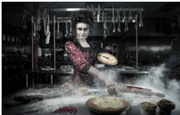
2014 National Silver ADDY winner