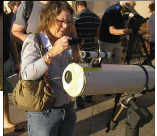
More than 70 visitors joined PSC astronomy enthusiasts in viewing the uncommon solar eclipse.