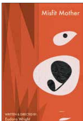
2014 National Gold ADDY winner