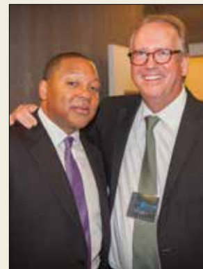
Top: Wynton Marsalis greets a Belmont Youth Band member before the show