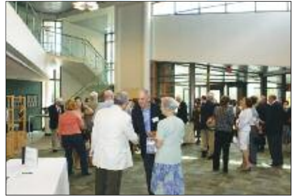
Spacious entrance to Chadbourne Library