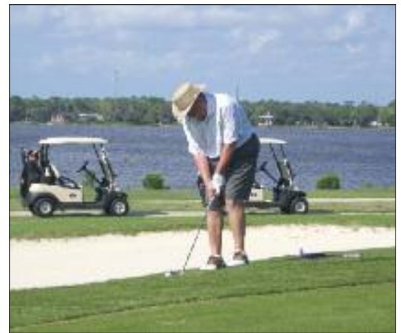
The Big Break Golf Classic at A.C. Read on Naval Air Station Pensacola raised much-needed funds for Universal Scholarships that assist students who fall between the financial aid cracks.