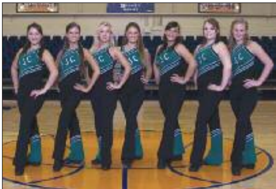
PJC dance team