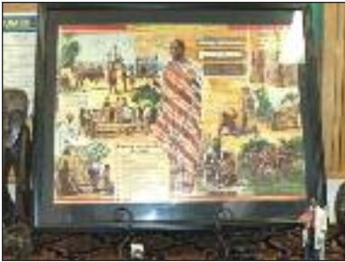
Each June, the Sankofa Heritage Festival showcases black culture with art, poetry, music and displays on the Warrington campus.