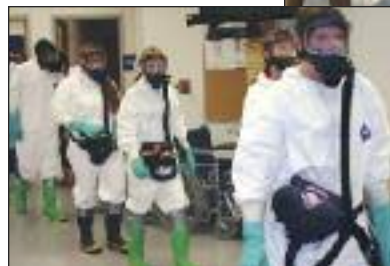
High School Health Camp