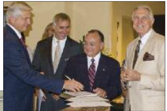
Signing the partnership