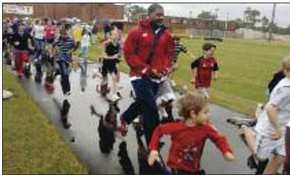
Olympic Gold Medalist Justin Gallin christens PJC's new track as he runs with children participating in the YMCA Kids Marathon in January.