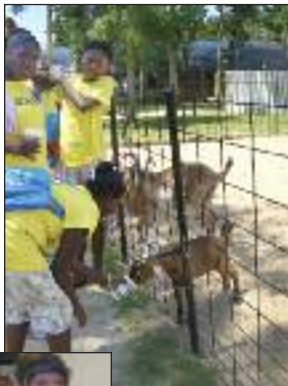
Kids College Environmental Camp, above