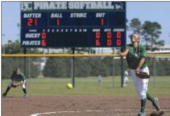
Lady Pirates made history as they played their first-ever softball game on the Pensacola campus, April 22, winning a double-header (11-0, 8-0) against Meridian Community College. Previously, PJC softball practices and games were played on the Milton campus. The new field saves the team time and costs resulting from daily trips to Milton.