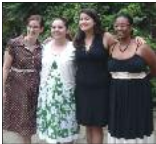
Robinson Honors students in London

The popular Junk to Art series of free workshops taught participants how to recycle household "junk" into creative art projects. Local artists also gave presentations.