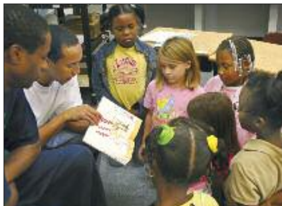
PJC basketball players read to Holm Elementary second graders