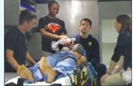
Students get hands-on experience in the ambulance simulator.

Massage Therapy students and Physical Therapist Assistant students also achieved 100 percent pass rate from National Board exams. Fire Academy students and Paramedic students scored 100 percent pass rates on State Certification exams.