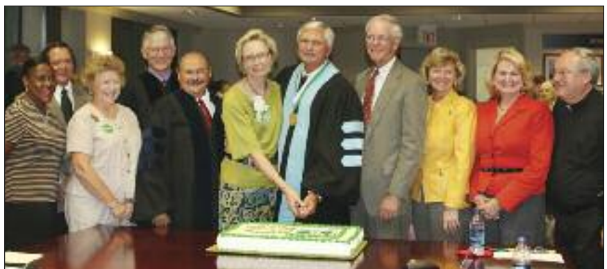
PJC District Board members celebrate the college’s sixth presidential investiture