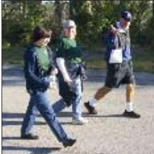
The American Heart Walk