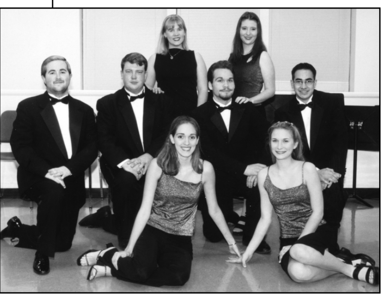
Above: PJC's Jazz Choir Entertainers provided holiday songs.

Development staff for going far beyond the call of duty to support the Foundation's efforts.