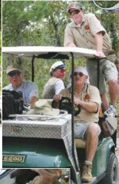
Shoal River team took first place

PJC's first-ever sporting clay tournament hit the bull's-eye, raising thousands of dollars to benefit Universal Scholarship recipients.