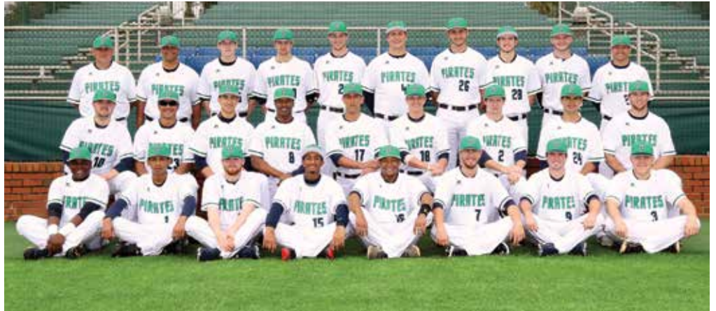
2016 Baseball Team