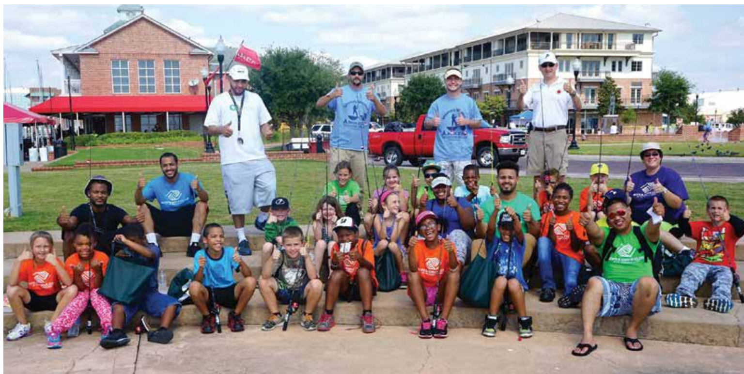
Wounded Warrior Anglers partnered with PSC EMT students to teach children to fish.