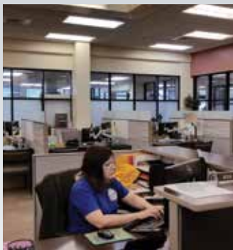
Advising Center — The Advising Center in the Delaino Student Center on the Pensacola campus was renovated to provide more privacy for students.