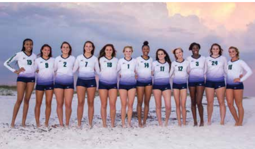
2016 Volleyball Team