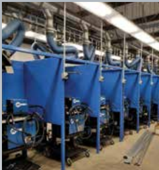
Welding Facility — A metal building on the Pensacola campus was remodeled for use by the college's welding program.

The PSC Foundation is engaged in raising $1 million to create an endowment to fund additional visual arts scholarships and program enhancement.