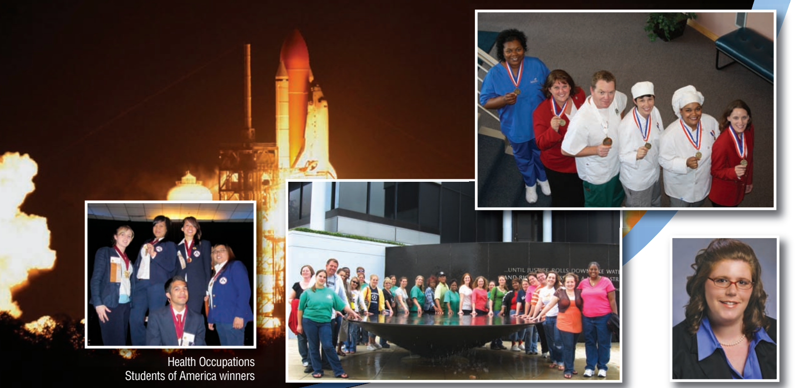
Education Club members at Civil Rights Museum