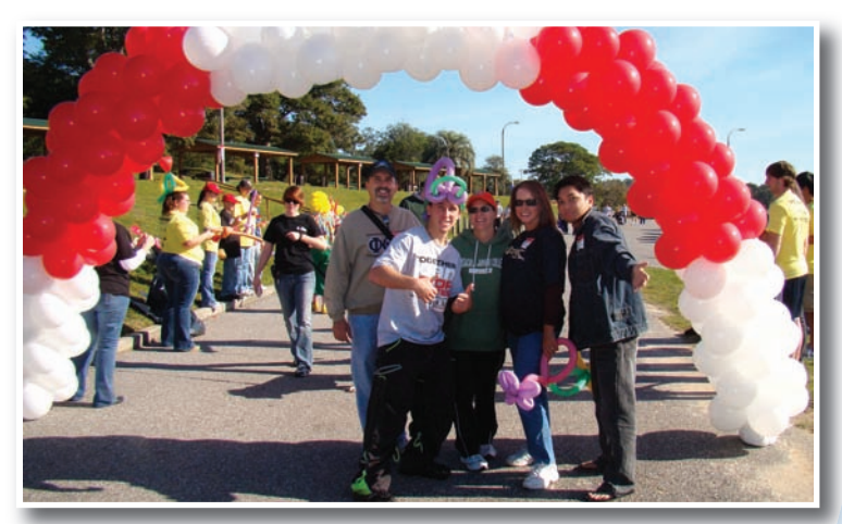
Above: Phi Theta Kappans at the Walk for Diabetes. Below: PTK members volunteer at Habitat for Humanity, Pensacola.

Throughout the year, Phi Theta Kappa continued its tradition of volunteer service, participating in the Diabetes Walk fundraiser, campus cleanup, annual fall Manna Food Drives, Habitat for Humanity and recycling print cartridges.